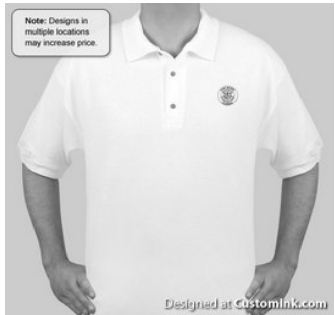
This is the type of shirt we are looking at